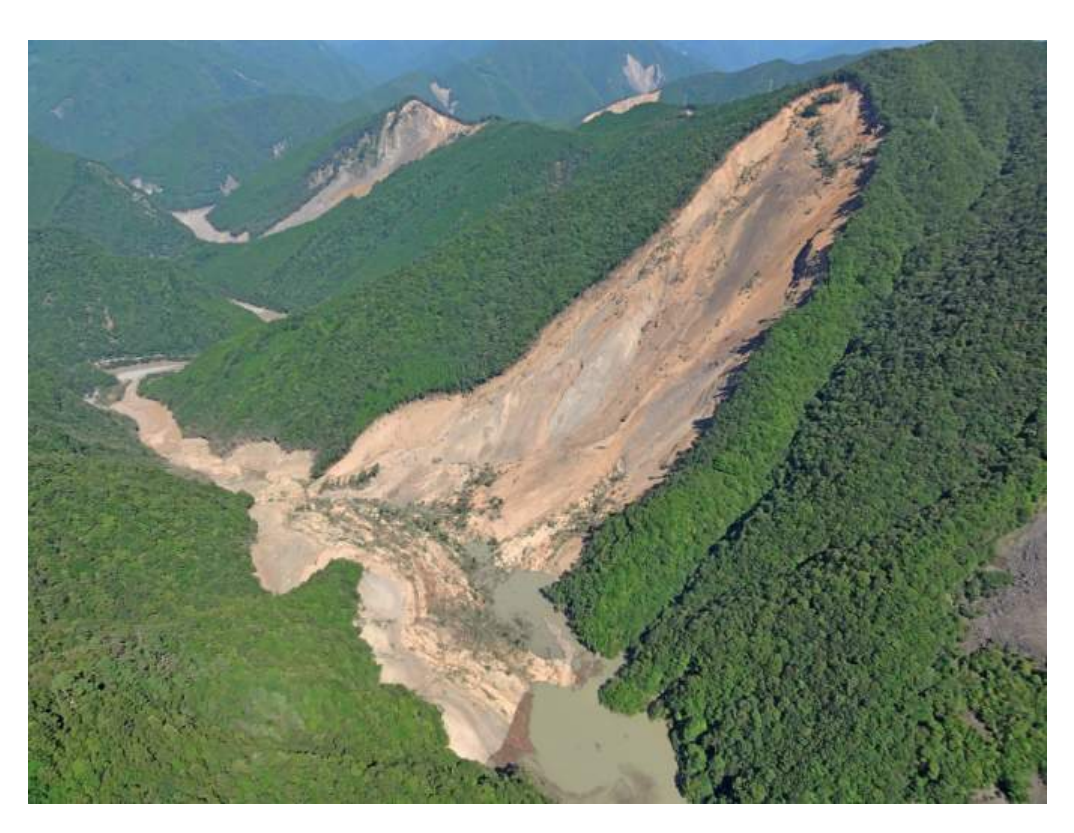
A Landslide dam caused by Typhoon 12 in September 2011 in Nara Prefecture